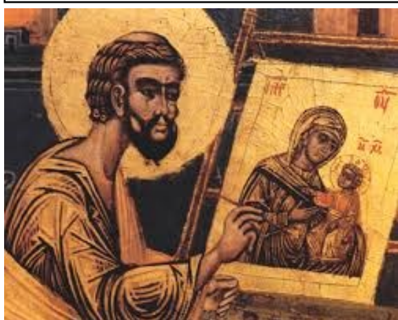
St. Luke - tradition says he painted the first icon of Our Lady - a style future icons followed

Bookings: Please contact Parish Office: 9499 1515 for Sacramental enrolments or appointments for Marriage